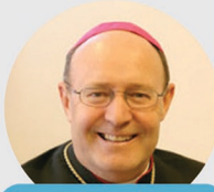
"Don't Mess with Marriage": a Pastoral Letter from the Catholic Bishops of Australia, June 2015.

"People who adhere to the perennial and natural definition of marriage will be characterised as old-fashioned, even bigots, who must answer to the law."