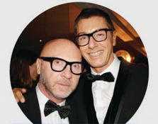
DOLCE & GABBANA (gay fashion designers) March 2015

Which future Prime Minister will have to apologise to the Motherless Generation?