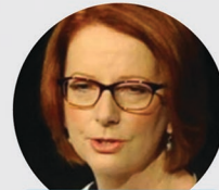
THE HON. JULIA GILLARD , National Apology for Forced Adoption, March 2013

"The most primal and sacred bond there is: the bond between a mother and her baby"