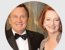
THERE IS EQUALITY WITHOUT MARRIAGE

Same-sex "marriage" abolishes either a mother or a father from the life of a child. It denies equality to kids.