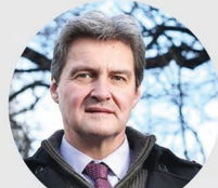
RODNEY CROOME , Australian Marriage Equality, June 2015

Gay people have the right to live as they choose, but no right to silence others who disagree with them on marriage and sexual right and wrong.