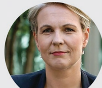
TANYA PLIBERSEK , Labor deputy leader, May 2015.