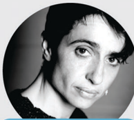
MASHA GESSEN , lesbian activist, Sydney Writers' Festival 2012.

"Fighting for gay marriage generally involves LYING about what we are going to do with marriage when we get there, because we lie that the institution of marriage is not going to change. And that is a lie. The institution of marriage is going to change, and it should change, and again I don't think it should exist."